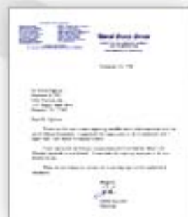
from: JOHN McCAIN US Senator