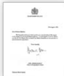
from: BUCKINGHAM PALACE - QUEEN OF ENGLAND