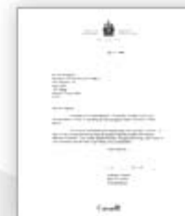
from: OFFICE OF THE PRIME MINISTER OF CANADA