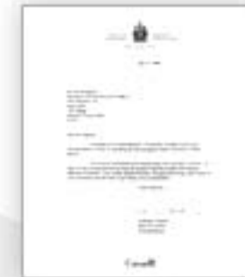
from: OFFICE OF THE PRIME MINISTER OF CANADA