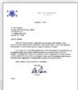
from: AL GORE US Vice President