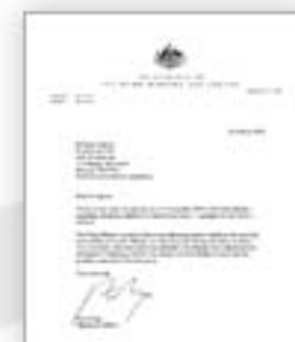
from: OFFICE OF THE PRIME MINISTER OF AUSTRALIA