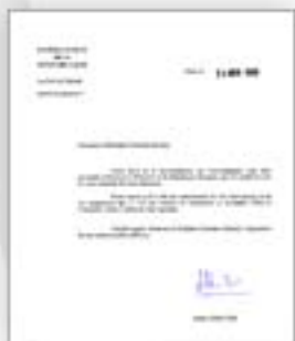
from: OFFICE OF THE PRESIDENT OF FRANCE