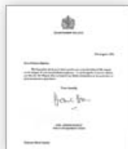
from: BUCKINGHAM PALACE - QUEEN OF ENGLAND