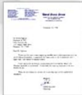
from: JOHN McCAIN US Senator