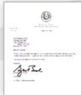
from: GEORGE W. BUSH Texas Governor - US President