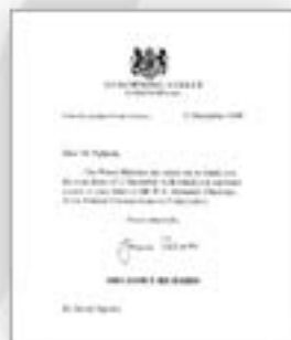
from: OFFICE OF THE PRIME MINISTER OF ENGLAND