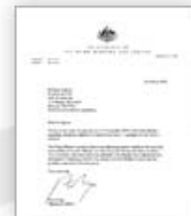
from: OFFICE OF THE PRIME MINISTER OF AUSTRALIA