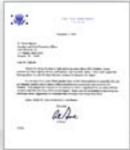
from: AL GORE US Vice President