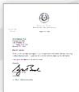
from: GEORGE W. BUSH Texas Governor - US President